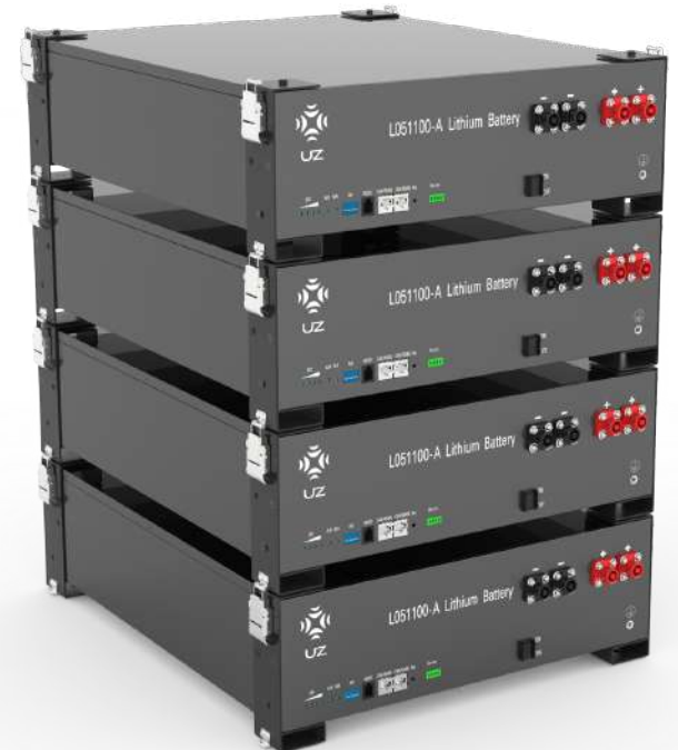
Bundle Installation Demo