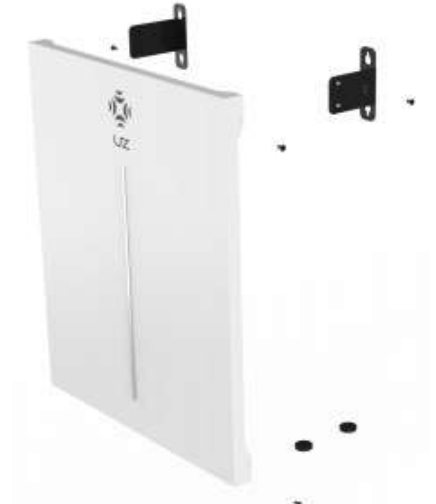
C100 (1 set)