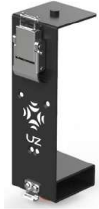
H100 (1 pcs)