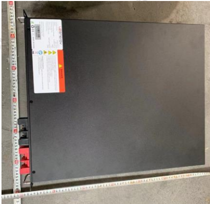
电池正面外观 Battery front appearance