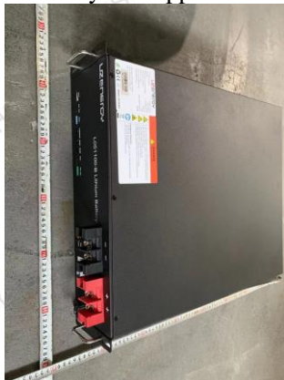
电池侧面外观 Battery side appearance