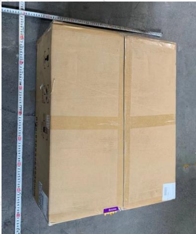
包装正面外观 Front appearance of Packaging